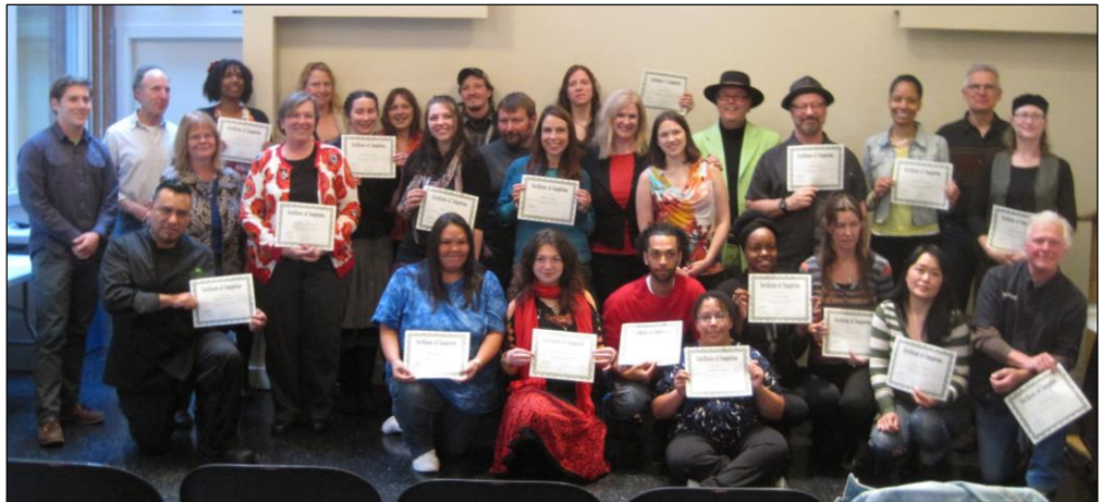
Graduates of our first ever product-focused BDT, held at the Pike Place Market

Our eight-week Business Development Training remains at the center of our work, and many clients find the support they need to get started with their businesses during the course or upon graduation. In total, 490 individuals participated in our business development trainings in the past year. We conducted 21 trainings in all, including eight trainings in King County, eight trainings in Spanish, and eight workshops for our participants enrolled in our East African program.